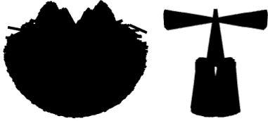
Figure 3: Visualization of 1000000 sampled postures from a single posture discretized with low (3, left) and high (21, right) granularity.

learned from natural language: good log-likelihood values for held-out testing sets and viewing the most likely words in each topic. While the log-likelihood’s interpretation is the same regardless of the data format, it is a relative comparison that indicates “better,” but not necessarily “good” or “bad” for each model’s representation of the data. Viewing the most likely words in each topic gives humans an opportunity to analyze the cluster on their own, and the authors often provide their own expert summary of the displayed topics. However, the most likely postures in each learned activity are not often as obvious to interpret. Figure 2 shows two examples of most likely postures for topics that appear to indicate the activities “sitting” and “one arm outstretched,” but both include similar arm positions. Therefore, how do we truly evaluate which qualities of the postures represent the activity?